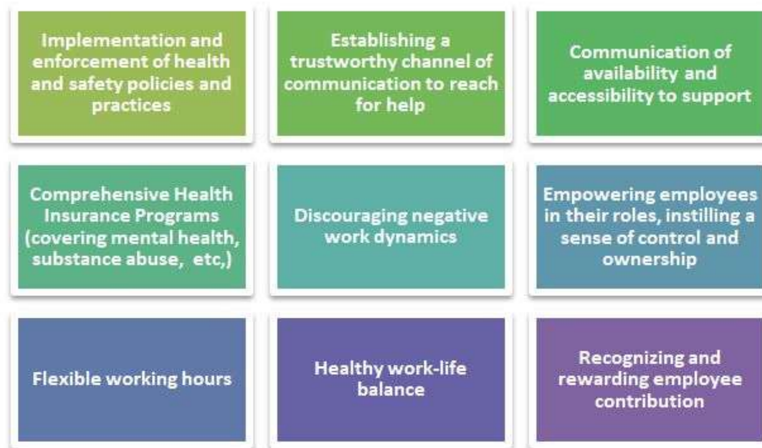
Figure 3: How workplaces impact mental health. Adapted from “Threats to a mentally healthy workforce” by Sarin 2019, People Matters. Retrieved November 20, 2019 from https://www.peplemattersglobal.com/article/work-culture/managing-mental-health-at-workplaces-22605